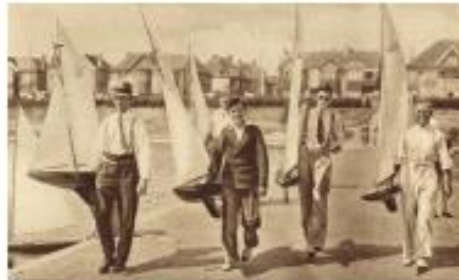
Hove model yacht club - heritage of watersports and related activities

Before Hove's urban expansion, most of the site area was part of the natural shingle beach, which was reclaimed to create a series of recreational spaces during the late 19th and early 20th, including the Lagoon, Bowling Greens, and other amenities, as part of the Western Lawns. The character of these spaces is defined as large landscape 'rooms' by the north-south access routes that connect Kingsway to the Esplanade. The wall along the Esplanade's rear is 'locally listed' and the project site's east end includes the southern part of two Conservation Areas. West Hove Seafront is in the liminal zone between land and sea, affected by the local climate, including salt-laden winds. Providing adequate shade and shelter for comfortable use of the Western Lawns' facilities has always been a particular requirement and challenge on the site.