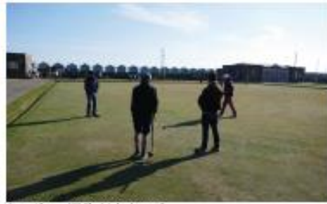
Croquet Lawns - WC block to background