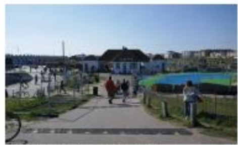
Cycle at Home Lagoon - existing skate park and play area