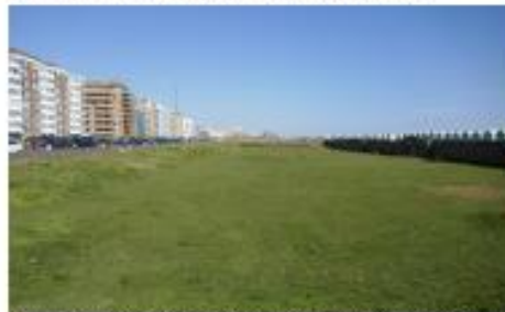
Western Lawns, the under-utilised public space between Kingsway and the Sea