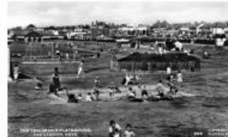
A developed site has always been a public landscape for health and wellbeing