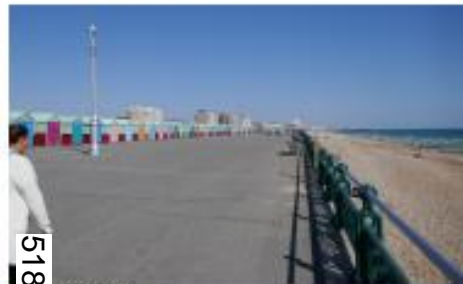
Esplanade and beach