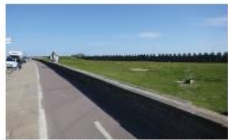
Western former Pitch & Putt space - cycle lane beside wall along Kingsway