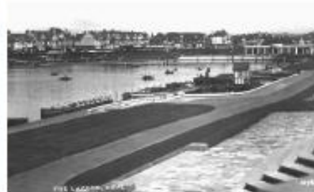
Hove Lagoon, 1830s