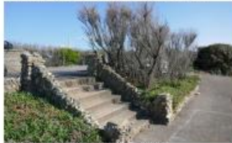
Accessible gardens (Sturges Garden beside Rockover)