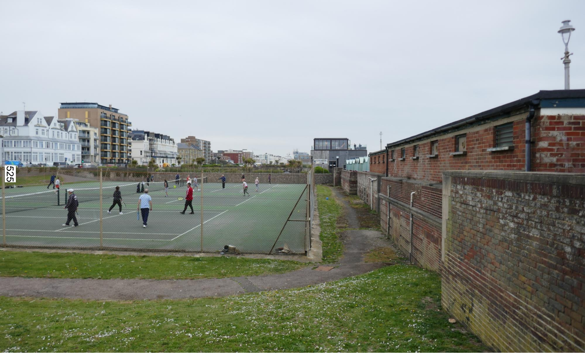
Existing View beside proposed Padel Tennis, looking east