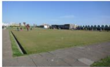
Existing sports areas (Craque lawn)