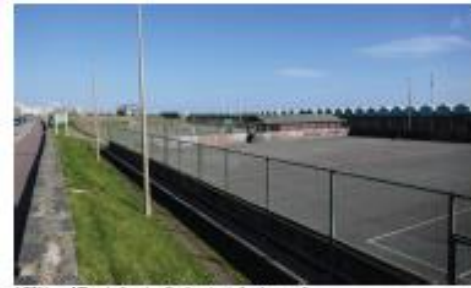
MUDA and Tennis Courts - Rockwater to background