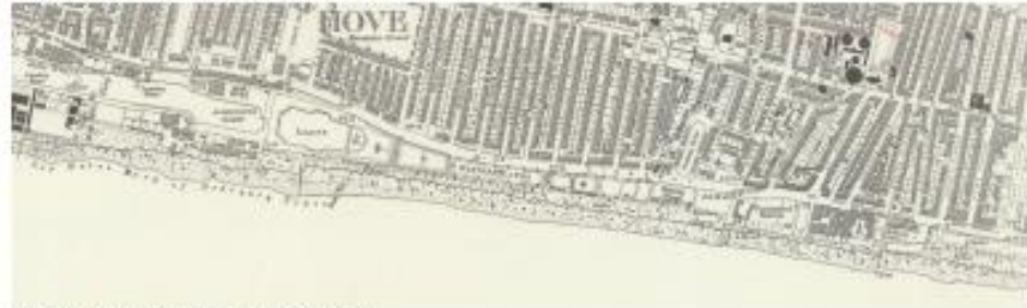
1932 - The Lagoon completes the urbanisation of the seafront