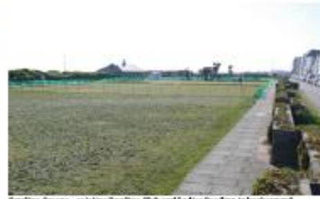
Bowling Greens - existing Bowling Club and Ladies Pavilion to background