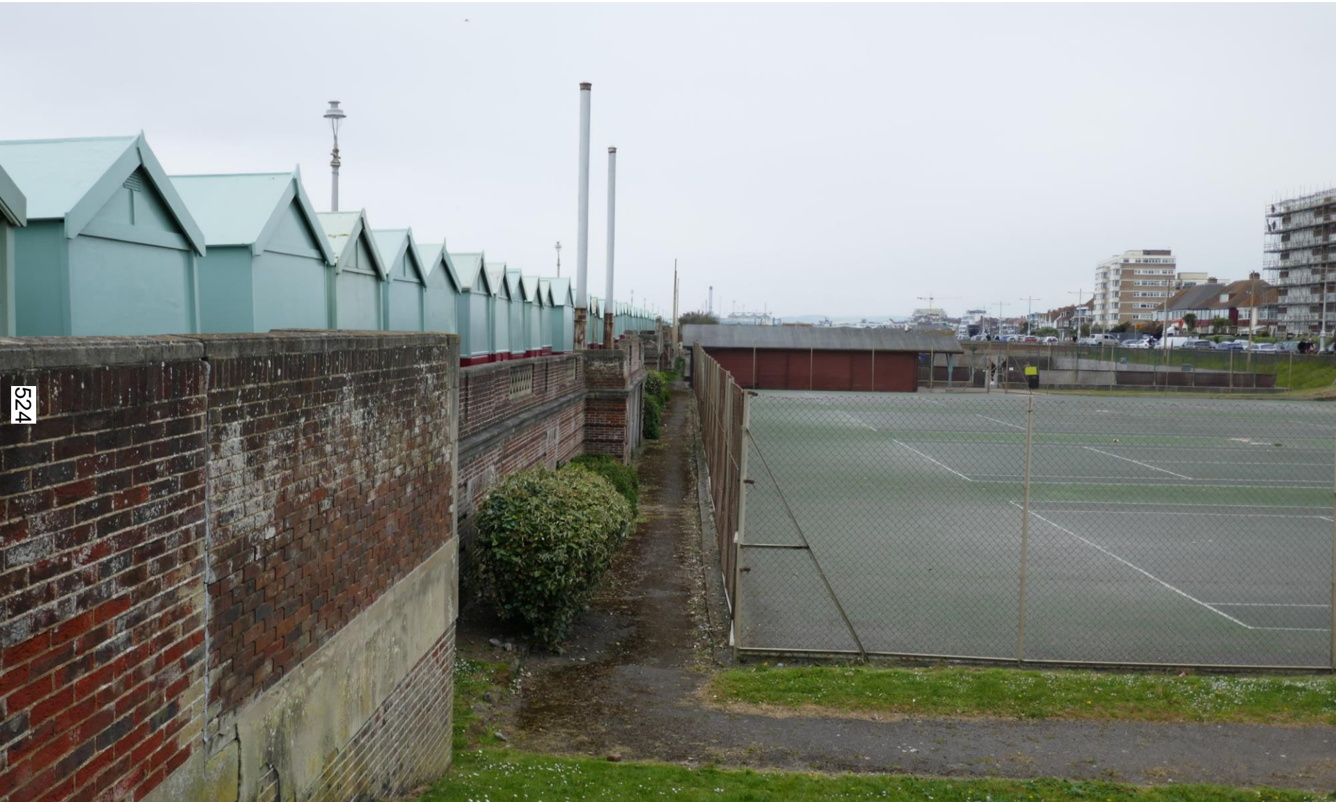
Existing View beside Tennis Courts, looking west