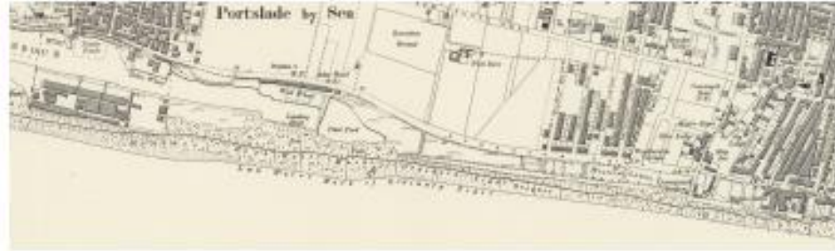
1904 - Seafront reclamation as development spreads westwards