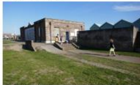
Historic buildings and 'locally listed' structures in the Conservation Areas