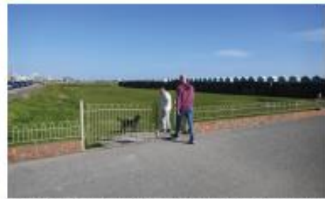
Western former Pitch & Putt - spaces inaccessible from cross-roads to Kingsway