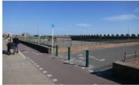
Accessible public realm spaces at Park stations (MUGA and Tennis)