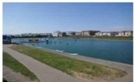
Home Lagoon - water sports area