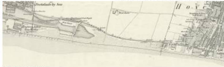
1879 - The site is a shingle beach